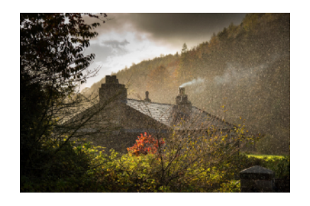
Autumn term 2023

I am sure that you agree that it will support our new curriculum in giving our children greater opportunity in the local area.